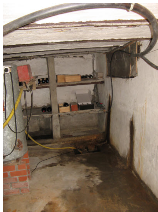
The Cellar First Aid Post used by Mairi Chisholm and Elsie Knocker

The building is now a house. In 1914 the railway embankment marked the Belgian front line. The route of old railway is now a cycle track and a nearby information panel marked sites along the route associated with fighting in the area.