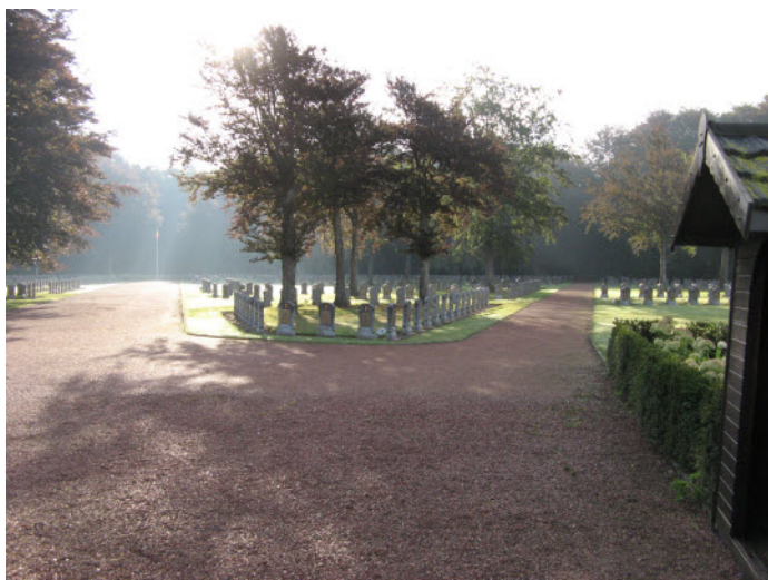
Belgian Military Cemetery at Houthulst Forest

After an extremely interesting day we were back at our hotel in Ieper in good time to attend the Last Post Ceremony at the Menin Gate. A fife and drum band from Scotland paraded and a lone bagpiper added a lament to the usual bugle call.