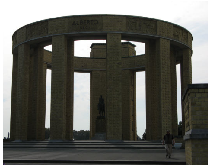
Albert Memorial, Ganzepoort Locks

in 1914 and whose graves are unknown. The bronze plaques listing the names are headed by Binyon's immortal words "They shall grow not old..." This stop doubled as our lunch break with tour members free to examine the Memorial and the nearby Albert Memorial to Belgium's King and Queen during the Great War or to head into the town. The Albert Memorial overlooks the Ganzepoort (Goose's Foot) – the complex of locks and sluices that enabled the Belgian defenders to flood the inland area and frustrate the German invaders in 1914.