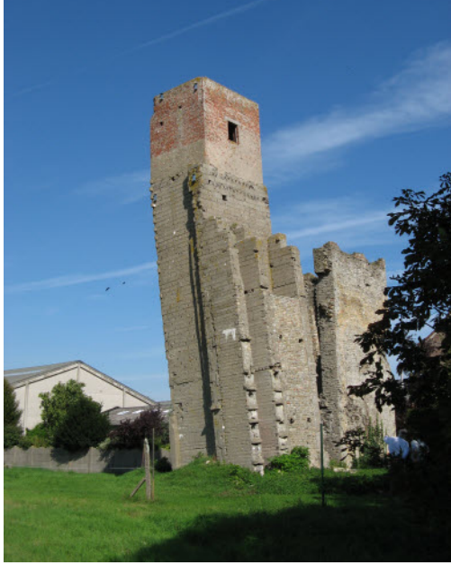
Belgian observation post - Pervijze Church

There was more for us to see in Pervijze. We were taken to a small museum in the local village hall. This displayed items of local military history from the Great War onwards. Most touching was a note in the visitor's book from a Canadian woman