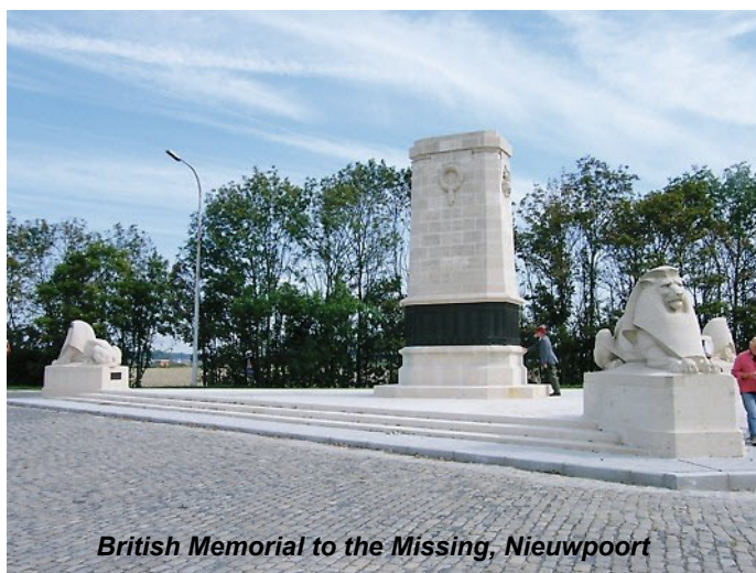
British Memorial to the Missing, Nieuwpoort

From Langemark headed for Nieuwpoort, halting first in the suburb of Ramskapelle, a vital position on the railway to Diksmuide in 1914. We visited the ruins of the old railway station an important feature in the battle, later used as an observation post. We moved on to the Belgian Military Cemetery nearby, and then to Ramskapelle Communal Cemetery that has CWGC plots from both world wars. Our final call before lunch was a Ramskapelle Road British Cemetery at St. Joris just outside Nieuwpoort. This cemetery was opened in 1917 when the British XV Corps held the line from St. Joris to the sea. It holds 841 British and Commonwealth casualties.