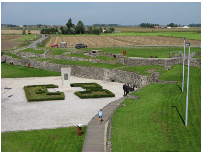
Dodengang Trench (Trench of Death) - Diksmuide

We moved on to the Belgian Army Memorial Chapel at Oud-Stuivenskerke with its stained glass. Nearby were the ruins of the original chapel, used as a fortified observation post in 1914-18, memorials to several Belgian regiments involved in the fighting on the Yser Front and a 1918 Demarcation Stone.