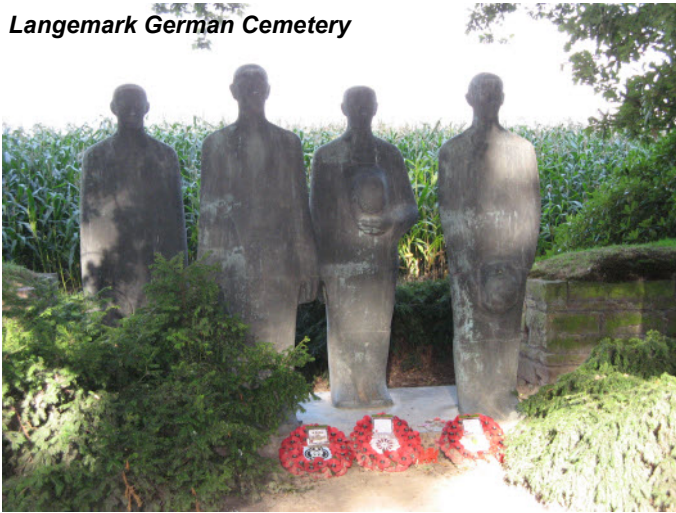
Langemark German Cemetery

Cemetery the previous day. Over 44,300 German war dead are buried at Langemark, more than 25,000 in a single communal grave. It is believed that two named British soldiers are buried with them. At the back of the cemetery is a group of four soldiers cast in bronze, standing in mourning for their fallen comrades.